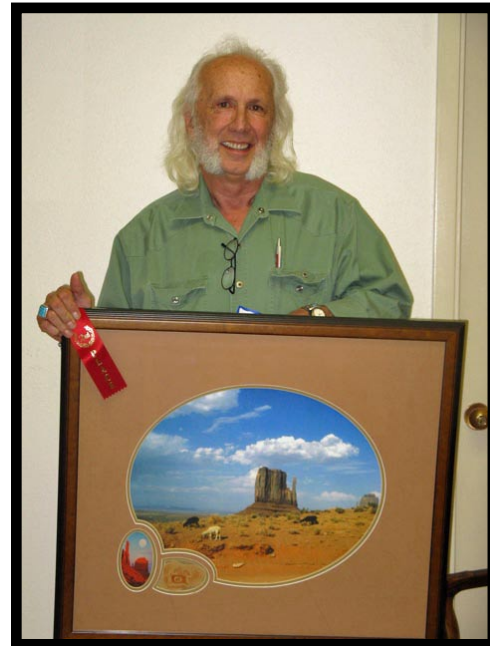
2nd Place Tie -

My inspiration for the painting was mostly the beautiful back lighting with the warm colored light. Also I loved the way the horses came near and posed for the photo that I worked from. I've learned to always paint the new and difficult, to push myself each time, and this is the first painting of horses that I've ever tried.