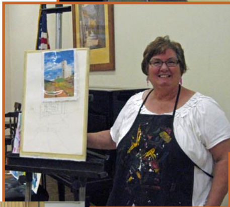
Our plan is to create a body of work for exhibition at various Tempe venues, and to use these images for cards and a calendar for 2012.