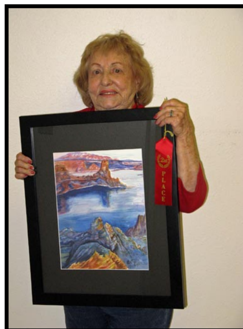
2nd Place Tie