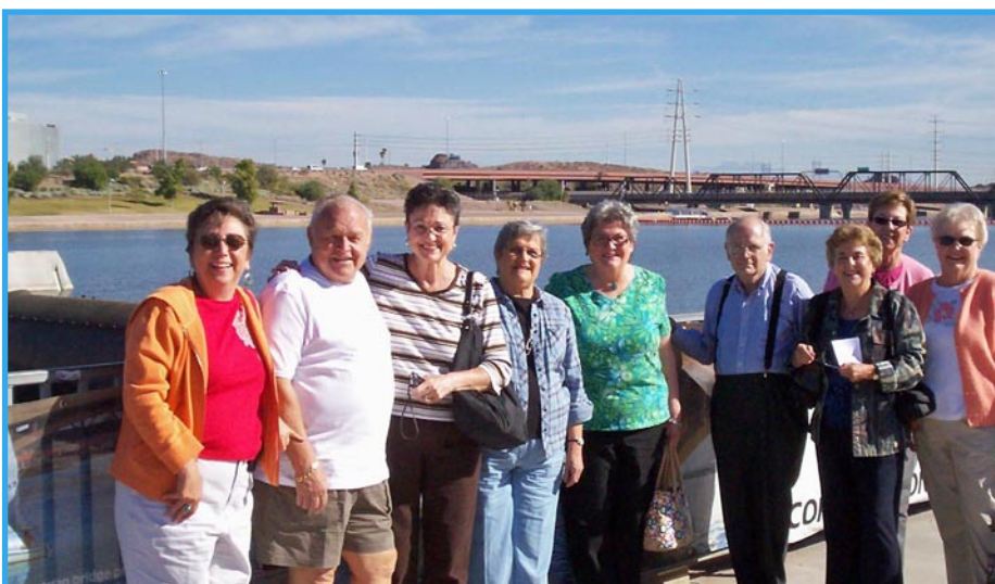
Several TAG members (Pictured at Tempe Town Lake) visited the Tempe Center for the Arts' Biennial Glass Exhibit. They also took the opportunity to photograph various locations in Tempe for the "Images of Tempe" project.