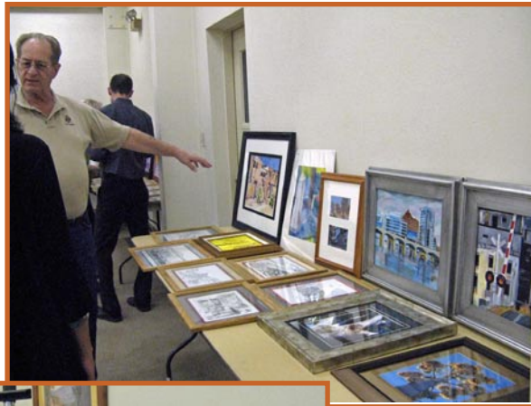
Members brought some examples of their work from the TAG "Images of Tempe" project.