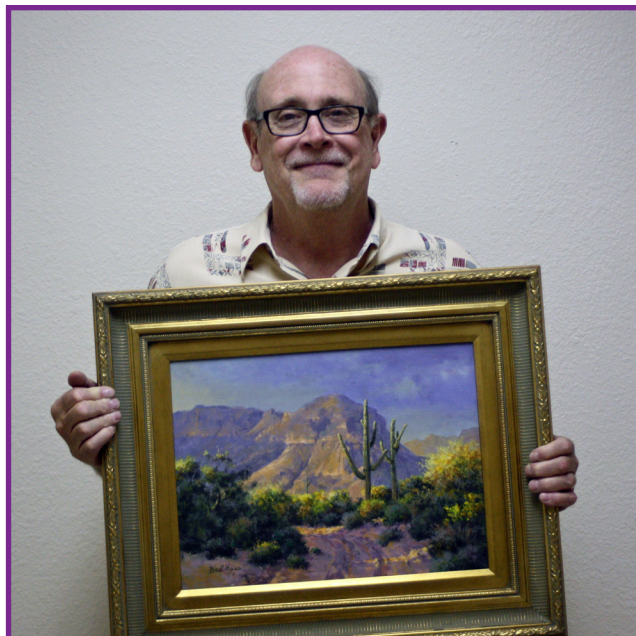
Bud Heiss's acrylic painting took 3rd place in the competition.

I took the photo to capture the Monarch butterfly as it lit on the pad. I only noticed the wonderful shadow cast by the butterfly and the amazing reflections in the lily pond afterwards. I found the work to be a challenge because of its diagonal composition and the various shadows and reflections necessary to give atmosphere to the piece."