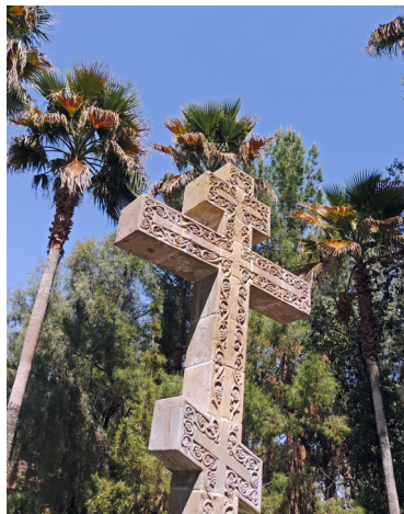
Greek Orthodox cross