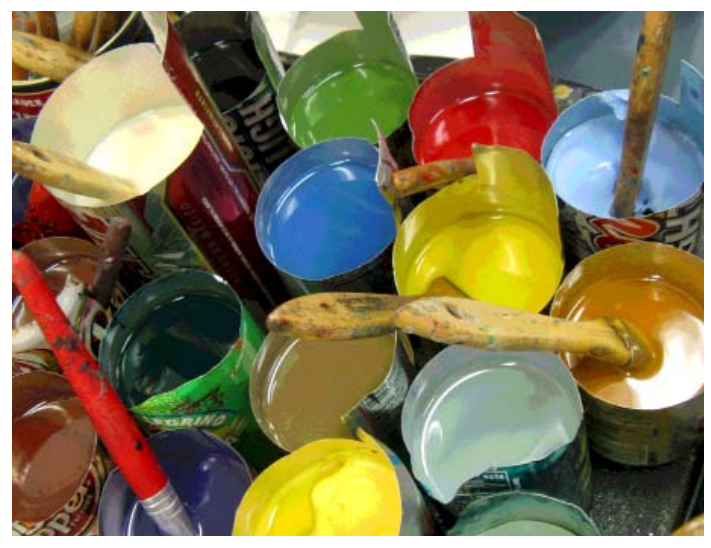
Bela's colorful collection of waxes create their own art!

Several members expressed an interest in her workshops, so she has offered a $60 discount for those who wish to take a two day Encaustic Workshop at her studio. This would lower the cost of the $330 workshop to $270, which would cover all materials. If interested, you may contact Bela at belafidel@hotmail.com