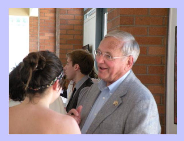
Congressman Mitchell with student artists

U.S. Capitol building along with winning student work from all the other states. It was an exciting and enjoyable experience for TAG members to see the work done by these young artists and to facilitate their recognition.