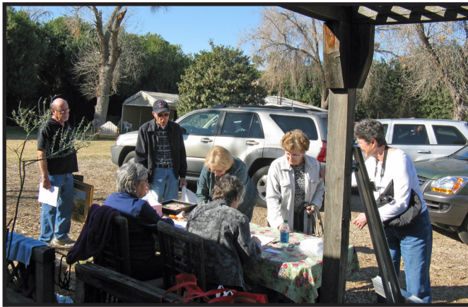
Artists checking in their work for the show

That's an outstanding statistic and says a lot about the Tempe Artists Guild.