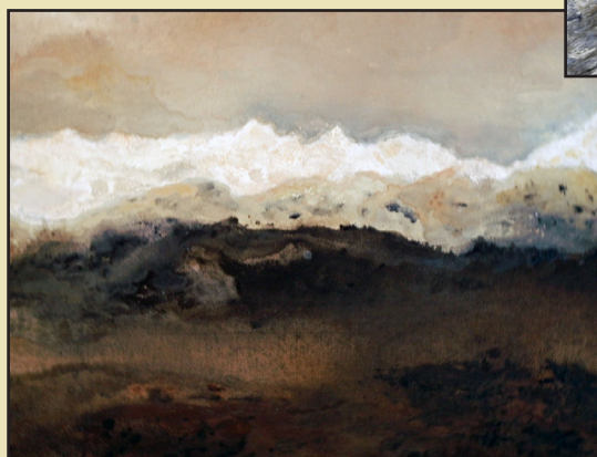
Above: Painting of mountains in New Zealand.