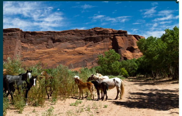
Canyon De Chelly

"I was in Window Rock, AZ, covering a Navajo Nation Conference put on by the John Wayne Cancer Foundation and the Arizona Myeloma Network. I was working with a film crew who documented the event; I did the photography for the event. It was a busy, busy three days, I was glad to be able to grab some scenery photos in between shoots, and during travel to and from. . . yea. . oh yeaaaa. ."