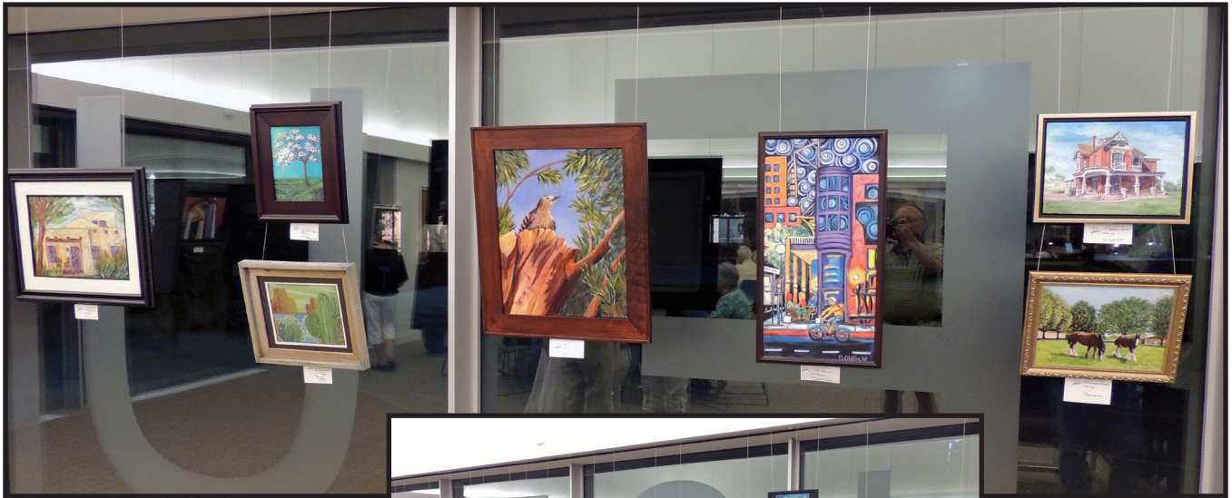
Pics from our 2012 reception at the Tempe History Museum.

WE HAD A GREAT RESPONSE TO OUR 1ST SHOW IN 2012!! WE'RE EXPECTING EVEN GREATER PARTICIPATION FROM OUR MEMBERS, AND SUPPORT FROM ART LOVERS WITH OUR 2ND SHOW!!!