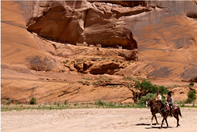
White House Ruins