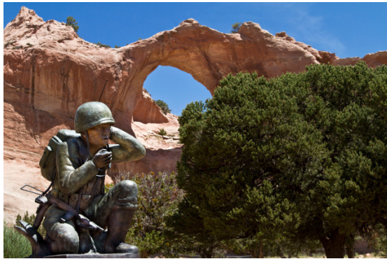
Navajo Code Talker memorial at Window Rock