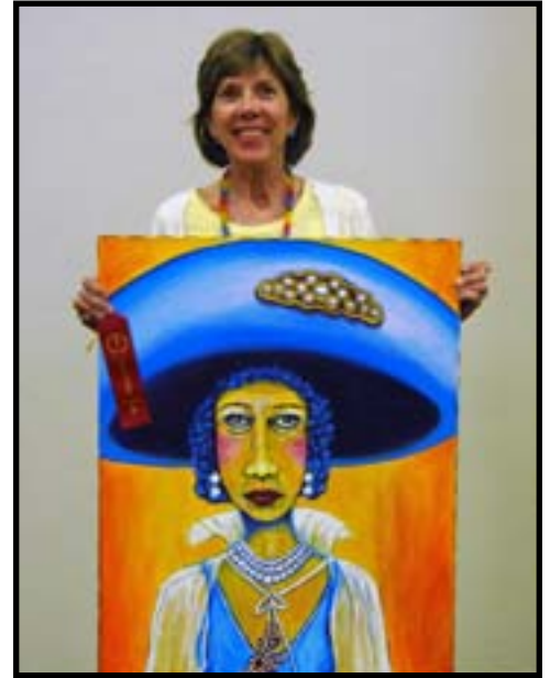
2nd Place (tied) - Deborah Oldfield

It depicts a scene at the Boyce Thompson Arboretum just before sunset. The faint, warm colored light and bold rock formations inspired the painting. I try to capture a specific place at a specific time of day in most of my works.