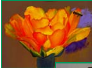
Artwork in various stages of completion