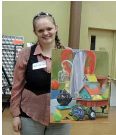
Katie Pearce, Acrylic still life painting