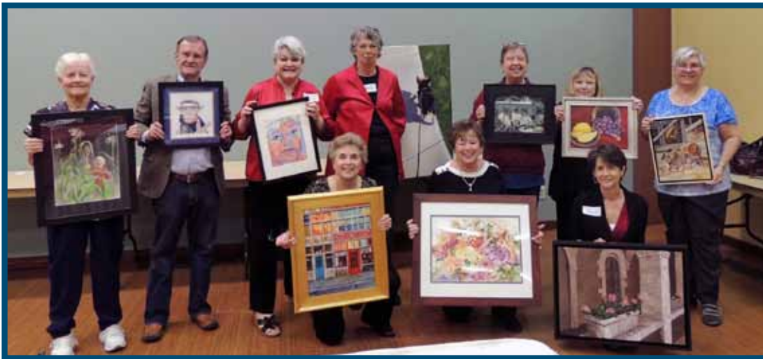
2014 Artist of the Month group photo.