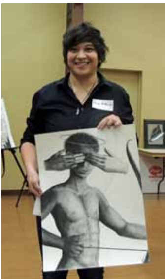
Ange McNeese, Charcoal drawing of Cupid